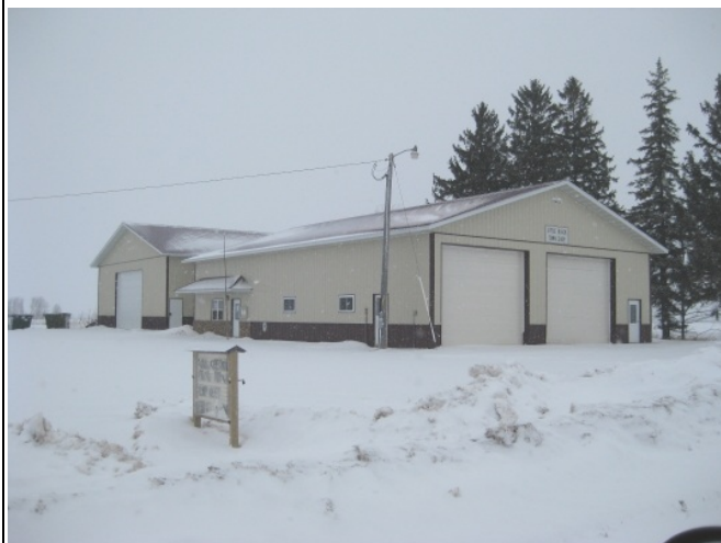
Figure 4.2 Little Black Town Hall and Shop

meetings are held the 2nd Sunday of the month at 7:00 PM. The town hall and shop has been refurbished in 2009. An equipment shed was built in 2008.