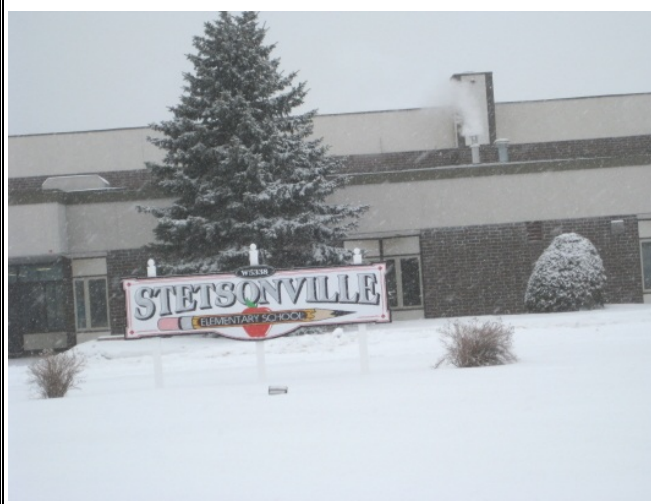
Figure 4.1 Stetsonville Elementary School

The Town of Little Black is served by the Medford School District, which is the largest district in Taylor County covering a 350 square mile area. The district has four separate facilities, which include the Medford Elementary School, located at 1065 W Broadway St., Medford Middle School, located at 509 Clark St., Medford High School, located at 1015 Broadway St., and the Stetsonville Elementary School, located at 5338 CTH A in the town of Little Black. According to the Wisconsin